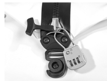
Wire loop for locking the bag with padlock (padlock not included)

OutDoor INDUSTRY AWARD 2014 (organised by Messe Friedrichshafen and Deutscher Designer Club) July 2014